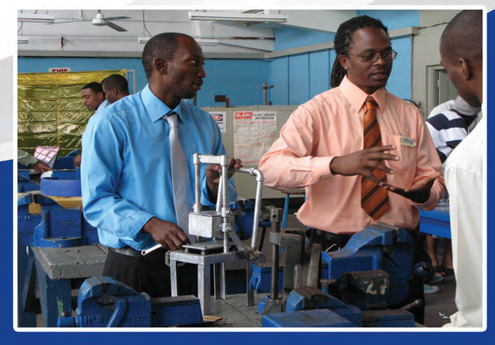
Excellence Through Knowledge