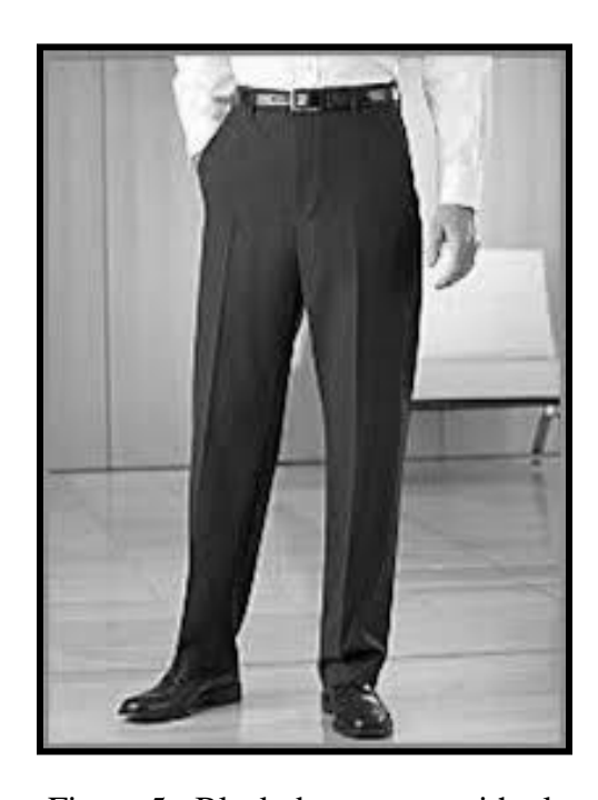
Figure 5: Black dress pants with pleats

NB: Shirt is to be tucked into the waist of the pants and worn with an appropriately sized plain black belt with an unadorned buckle.