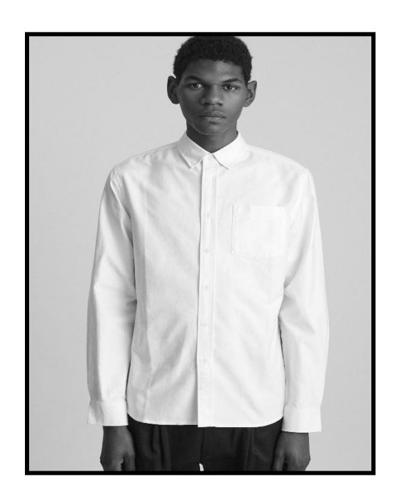
Figure 4: Plain (unadorned), White, long sleeve, button-front shirt.