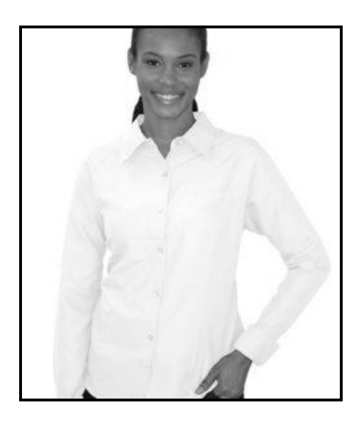
Figure 1: Plain, white, long sleeve, button-front blouse