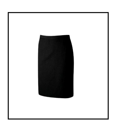
Figure 2: Black A-line skirt