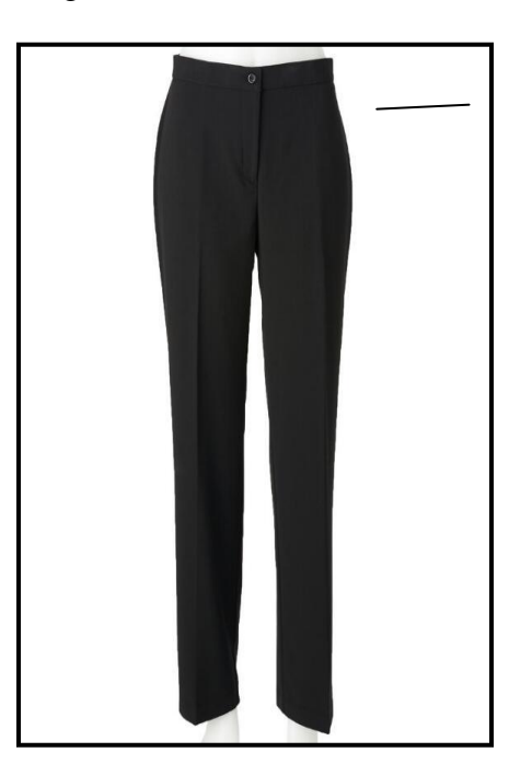
Figure 3: Black tailored pants

NB: Blouse is to be tucked into the waist of skirt, however if wearing pants this should be worn with an appropriately sized plain black belt with an unadorned buckle.